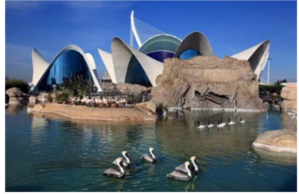
Valencia's Ciudad de las Ciencias, one of the most awesome places to visit